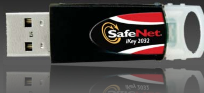
SafeNET iKey™ 2032 USB Cryptographic security comes as standard for all PersonalSign and PersonalSign professional solutions – Portable/Flexible/Reliable

Enterprise PKI Lite (from Q2 2009) for includes options for an Enterprise to manage the full life-cycle of Digital IDs issued under their organization name. i.e. Individual signing USB tokens or central-based credentials for either role-based signings or server held individual Digital IDs. Distributed implementations involve providing organization administrators (acting as the organization registration authority) a bulk shipment of Safenet USB tokens which work in conjunction with Acrobat Standard/Professional/3D. Centralized, server-based implementations work with SafeNet hardware security modules (optionally sold) that are highly integrated with Adobe’s LiveCycle Enterprise Server suite. The net result is a highly automated solution with robust signing functionality.