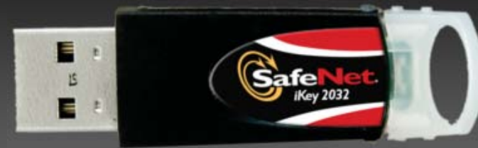
SafeNET iKey™ 2032 USB Cryptographic security comes as standard for all PersonalSign and PersonalSign professional solutions – Portable/Flexible/Reliable

Enterprise PKI Lite (from Q2 2009) for includes options for an Enterprise to manage the full life-cycle of Digital IDs issued under their organization name. i.e. Individual signing USB tokens or central-based credentials for either role-based signings or server held individual Digital IDs. Distributed implementations involve providing organization administrators (acting as the organization registration authority) a bulk shipment of Safenet USB tokens which work in conjunction with Acrobat Standard/Professional/3D. Centralized, server-based implementations work with SafeNet hardware security modules (optionally sold) that are highly integrated with Adobe’s LiveCycle Enterprise Server suite. The net result is a highly automated solution with robust signing functionality.